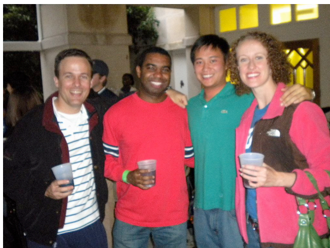
Brothers, alumni, and friends meet outside The Lodge at the alumni barbecue on homecoming weekend.