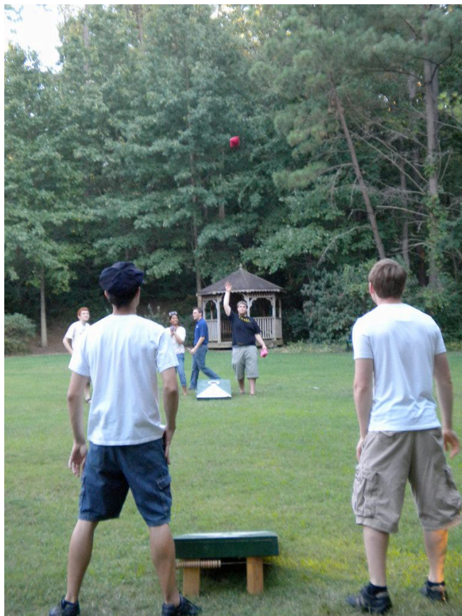
Brothers, recruits, and friends play a friendly game of cornhole at Chi Psi's first recruitment barbecue.