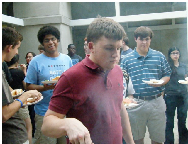
Recruits meet Brothers, socialize, and enjoy food at Chi Psi's first recruitment barbecue.