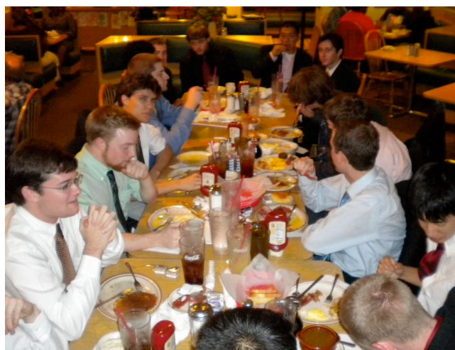
Brothers and pledges gather for a midnight meal at Honey's.